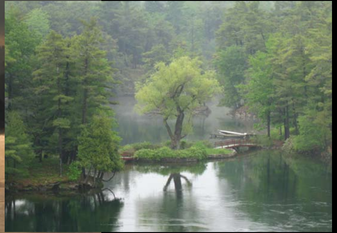
Above: I'm often asked about my choice of camera. The answer is: "Whatever is with me when I need it." For exactly this reason I almost always carry a pocket camera with me when my camera bag is left behind. This spring shot in the Lost Channel shows the rewards.