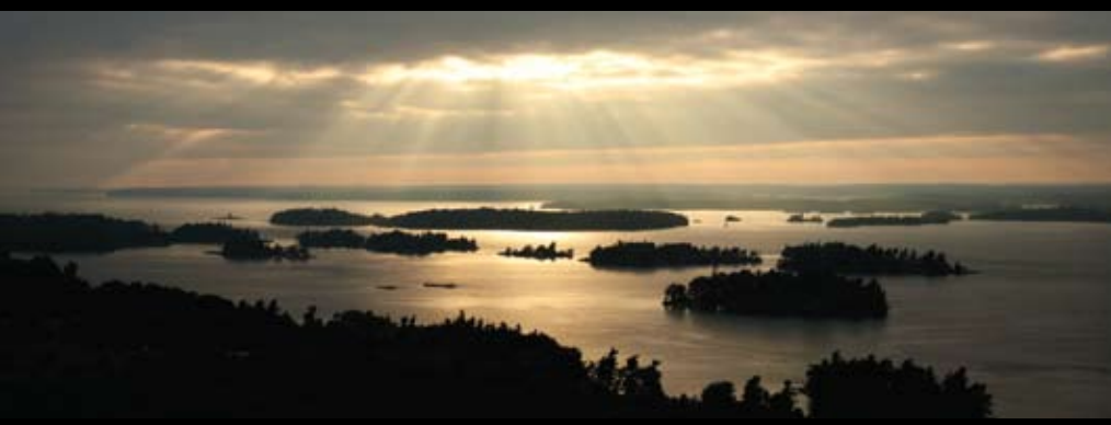
Left: I was formation flying with another Challenger as part of a History Channel documentary about ultralight aircraft when this magical scene appeared in the Lake Fleet Islands. A frustrated cameraman in the other plane couldn't understand why I had bolted until he later saw this shot.