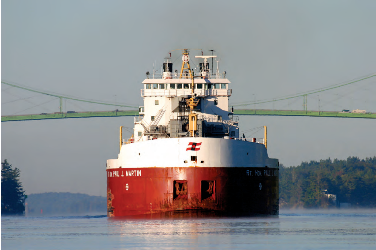
The Thousand Islands Bridge.

THOUSAND ISLAND FACTS: THE THOUSAND ISLANDS EXTEND ON THE CANADIAN SIDE FROM WOLFE ISLAND NEAR KINGSTON, ONTARIO, TO THE BROCKVILLE NARROWS AT BROCKVILLE, ONTARIO. • ON THE AMERICAN SIDE THEY EXTEND FROM TIBBETS POINT ON LAKE ONTARIO TO MORRISTOWN. • FRENCH NAME