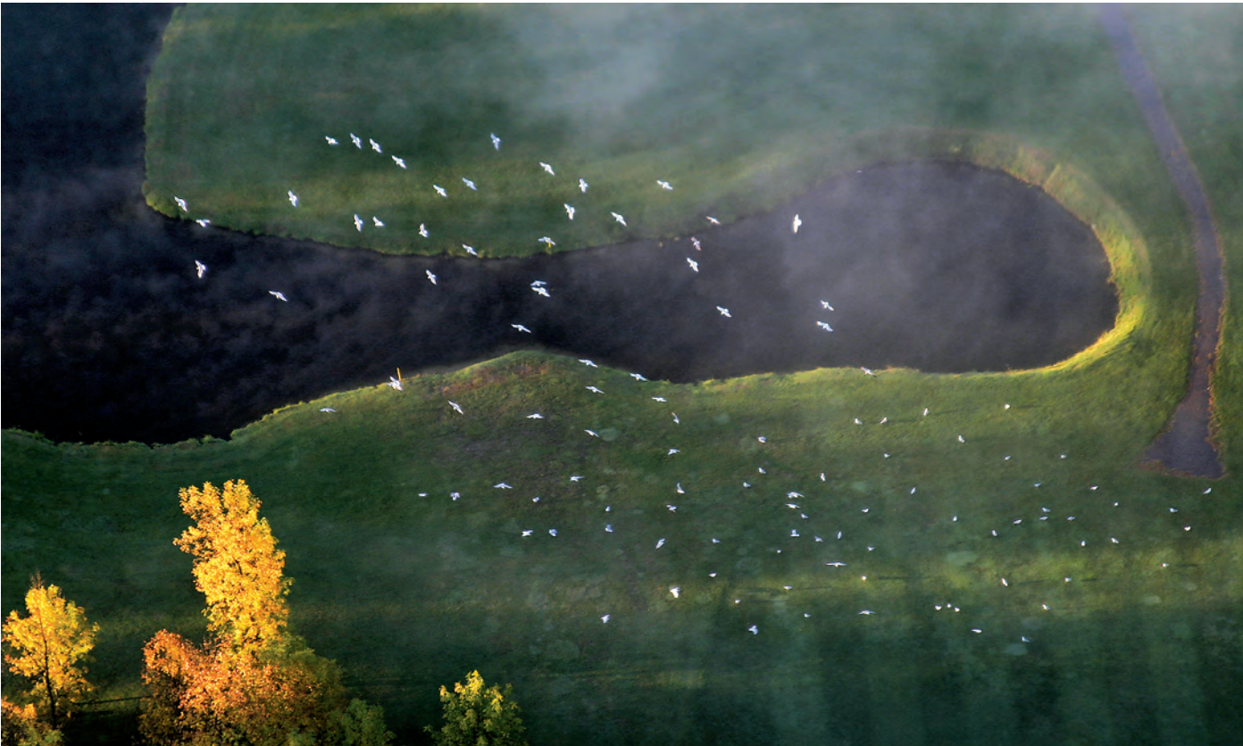
Thousand Island Country Club's Lake Course on Wellesley Island.

CRIES OF WAR. MANITOU RETURNED AND WRAPPED THE GARDEN IN HIS BLANKET. AS HE WAS ABOUT TO PART THE SKY-CURTAIN, HIS BLANKET BROKE. DOWN TUMBLED THE GARDEN INTO THE ST. LAWRENCE, BREAKING INTO PIECES, BIG AND LITTLE, THAT BECAME THE THOUSAND ISLANDS. (SOURCE: WWW.ROCKPORTCRUISES.COM)