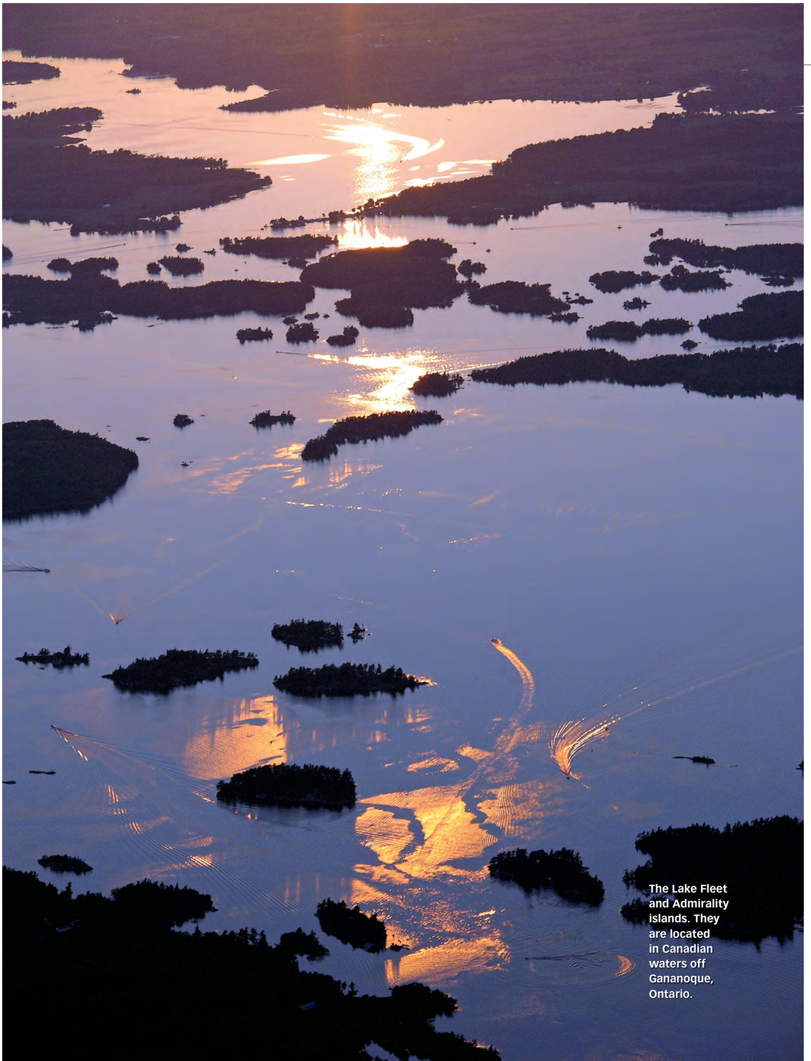
The Lake Fleet and Admiralty islands. They are located in Canadian waters off Gananoque, Ontario.