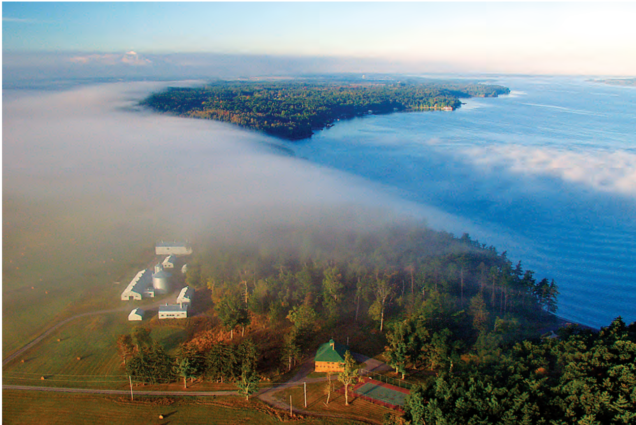
West of Bartlett Point and French Creek Bay.

FOR THE THOUSAND ISLANDS IS MILLE ILES. • NATIVE AMERICAN NAME TO THE ISLANDS IS GARDEN OF THE GREAT SPIRIT. • THE ST. LAWRENCE SEAWAY TOOK FOUR YEARS TO BUILD, BEGINNING IN 1955. (SOURCES: "PICTORIAL HISTORY OF THE THOUSAND ISLANDS" AND THE ST. LAWRENCE RIVER RESTORATION COUNCIL)