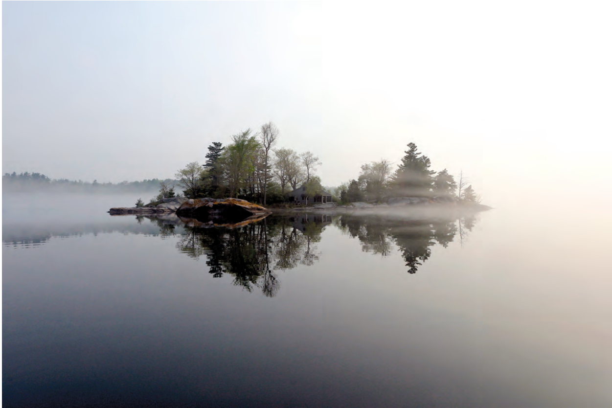
A view of Crossover Island Light.

NATIVE AMERICAN FOLKLORE TELLS THIS TALE: LONG AGO, MANITOU, THE GREAT SPIRIT, CAME DOWN TO EARTH, BECAUSE THE PEOPLE WERE FIGHTING. HE CALLED THEM TOGETHER AND GAVE THEM A BEAUTIFUL GARDEN, TELLING THEM THEY MUST NOT FIGHT. FOR A TIME, ALL WENT WELL. BY AND BY, THERE WERE THE